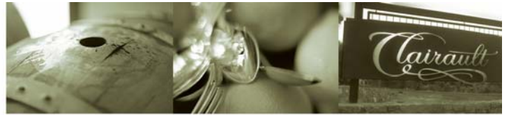
Family owned, distinctly Margaret River.