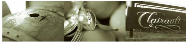
Family owned, distinctly Margaret River.